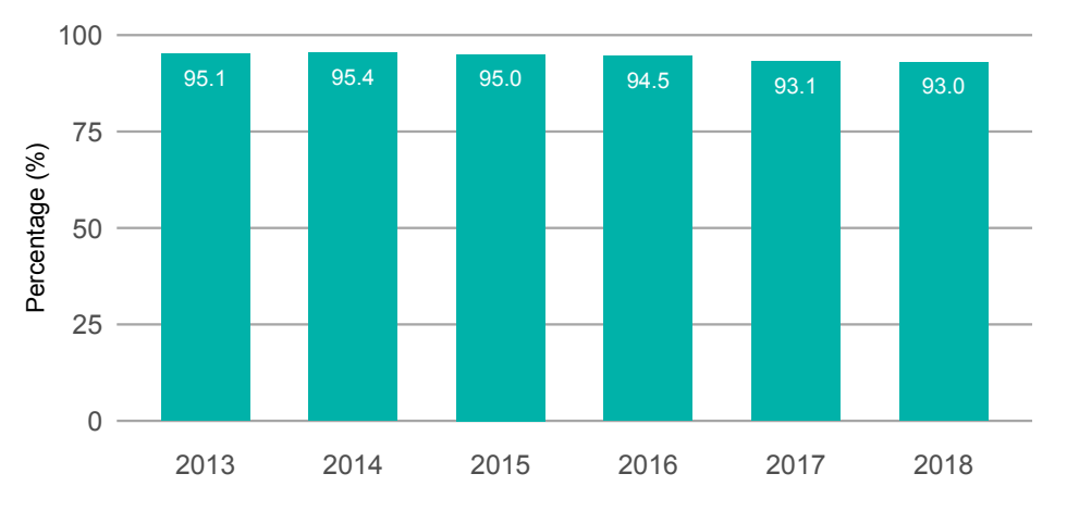
Figure 48: Proportion of school-based staff who agree that this is a good school

Note: The proportion presents the aggregation of positive responses (somewhat agree, agree and strongly agree) to the statement this is a good school.